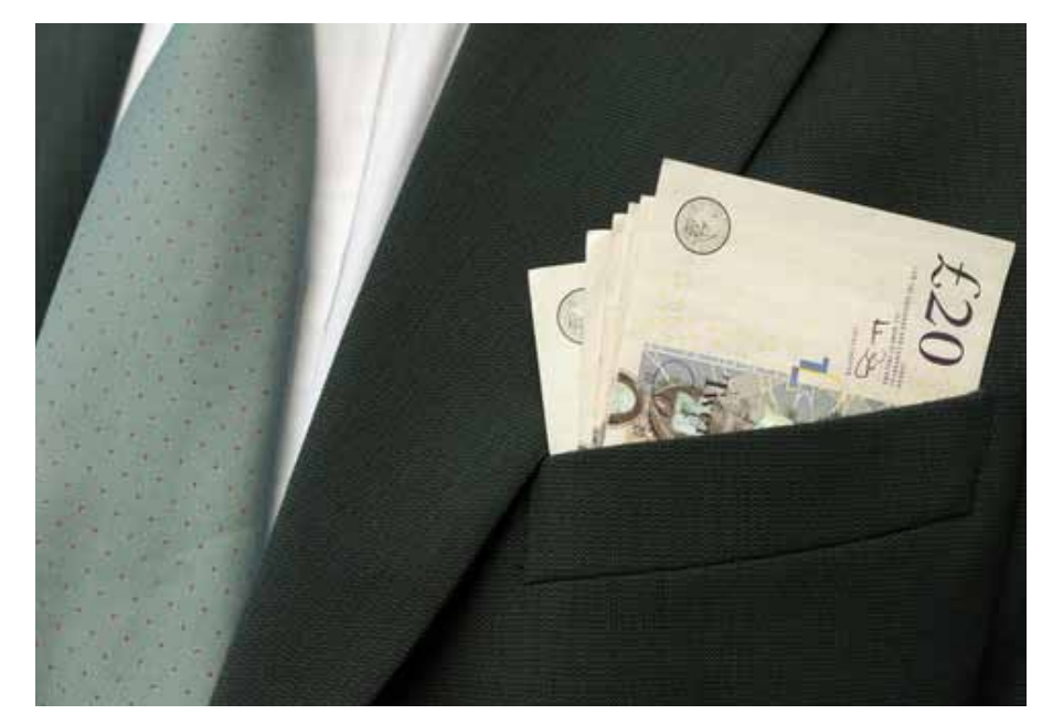
Comment: unless and until Lord Justice Jackson's reforms are implemented, success fees from both CFAs and CCFAs remain recoverable from the losing party.

The defendants were successful at first instance in persuading the judge that no success fee should be allowed but lost when the claimant appealed. The defendants then appealed to the Court of Appeal which whilst expressing some sympathy for the defendants (who were being asked to pay the success fee at a time of austerity) held that as the law stood a wealthy individual or company was entitled to benefit from a Conditional Fee Agreement (CFA) or a CCFA as much as a poor one.